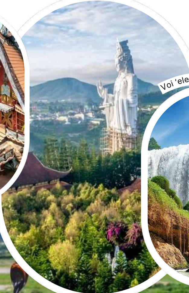
Voi 'elephant' waterfall