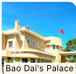
Bao Dai's Palace